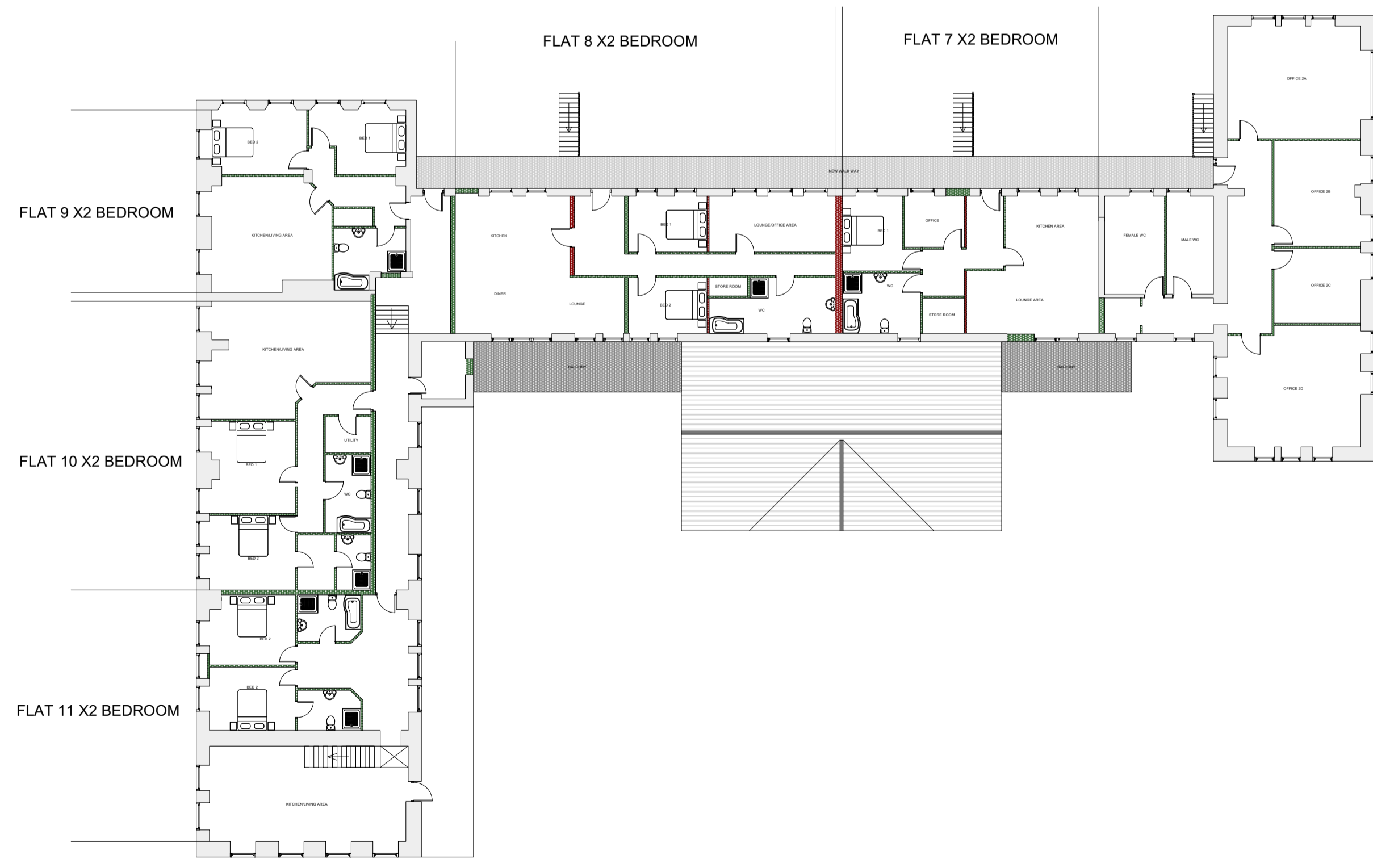
3 PROPOSED FIRST FLOOR Scale: 1:200