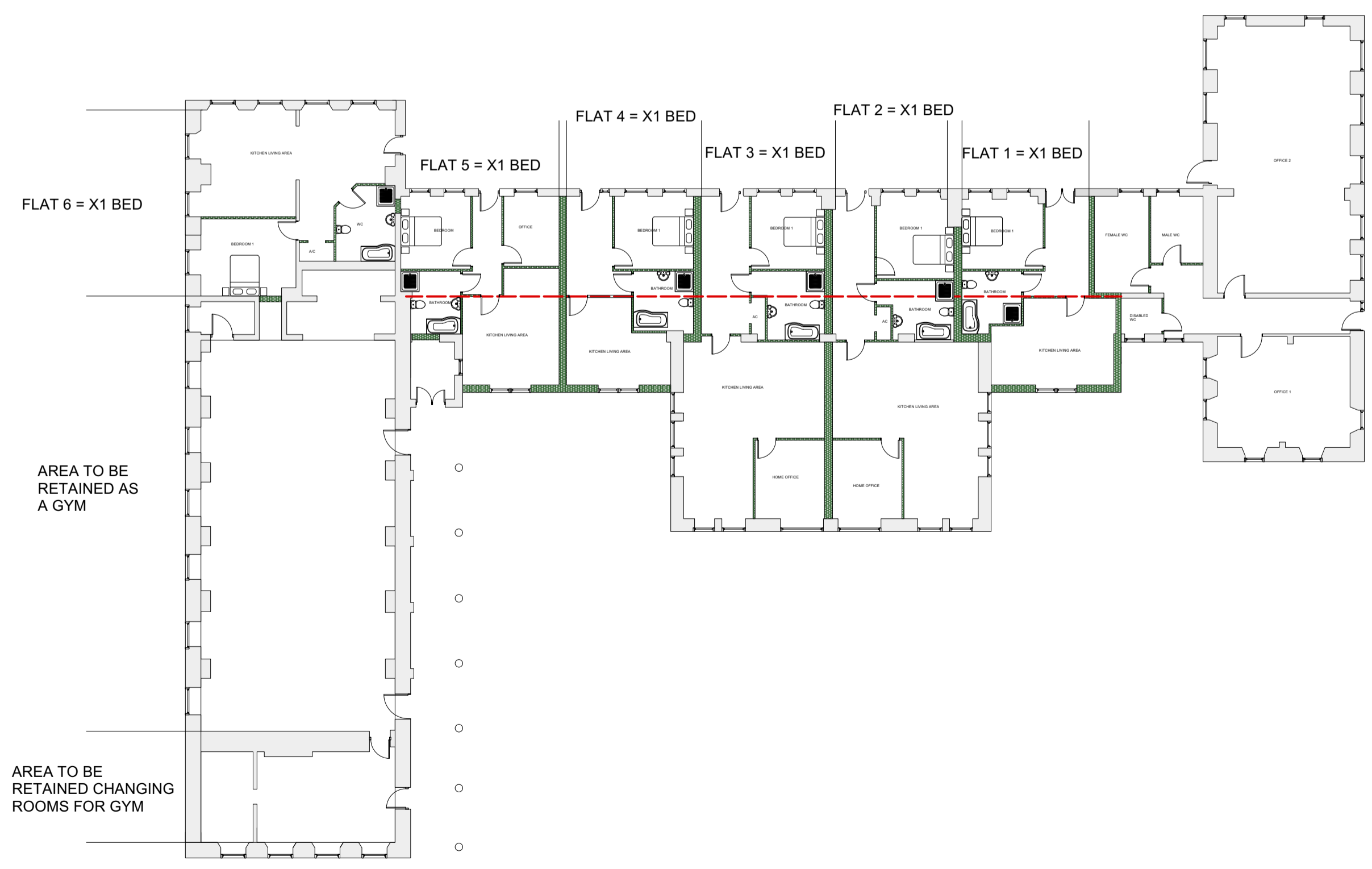
2 PROPOSED GROUND FLOOR Scale: 1:200